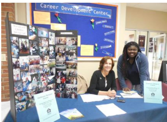
McAuley Center's Display at Keystone Service Fair