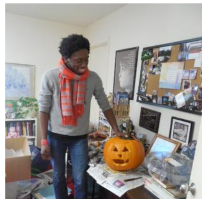
Admiring the finished sample