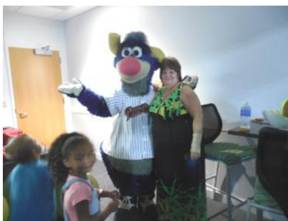
Rail Riders Mascot entertains Center's Families at baseball outing provided by One Point.