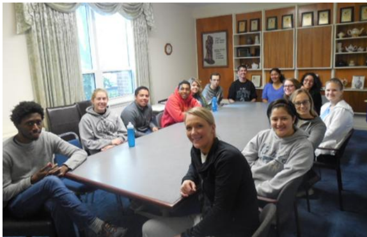
Volunteers from King's College Shoal Center are all smiles as they learn about the family party they have come to serve.