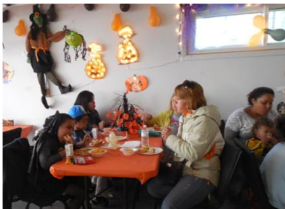
Time for a food break !