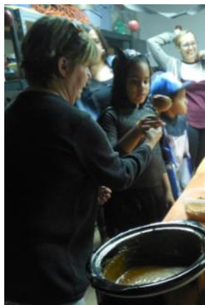
First step in apple creation