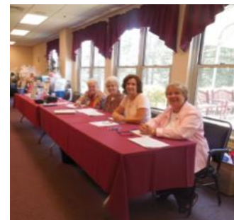
Waiting to record winners