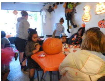
Nothing beats a trip to the pumpkin patch except the chance to design and carve your family's choice, all under the watchful eyes of King's students..