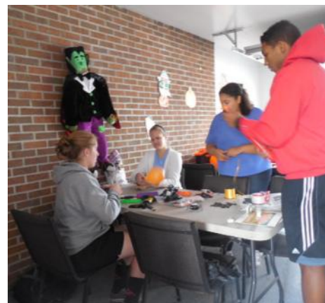
King's students prepare decorations