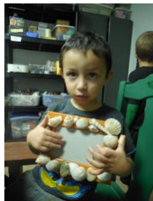
Families work together to produce one of a kind picture frames from buttons & shells.